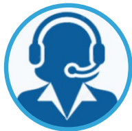
Expert Mentoring Guided-Help Session (3 Hrs.)