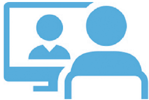
Anytime Webinar Video

Are your OSHA & HIPAA Compliance Requirements Comprehensively Updated to meet the new COVID Mandates?