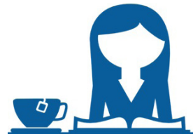
Self-Study (12 Hrs.)