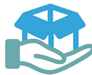
DENTAL COMPLIANCE IN-A-BOX